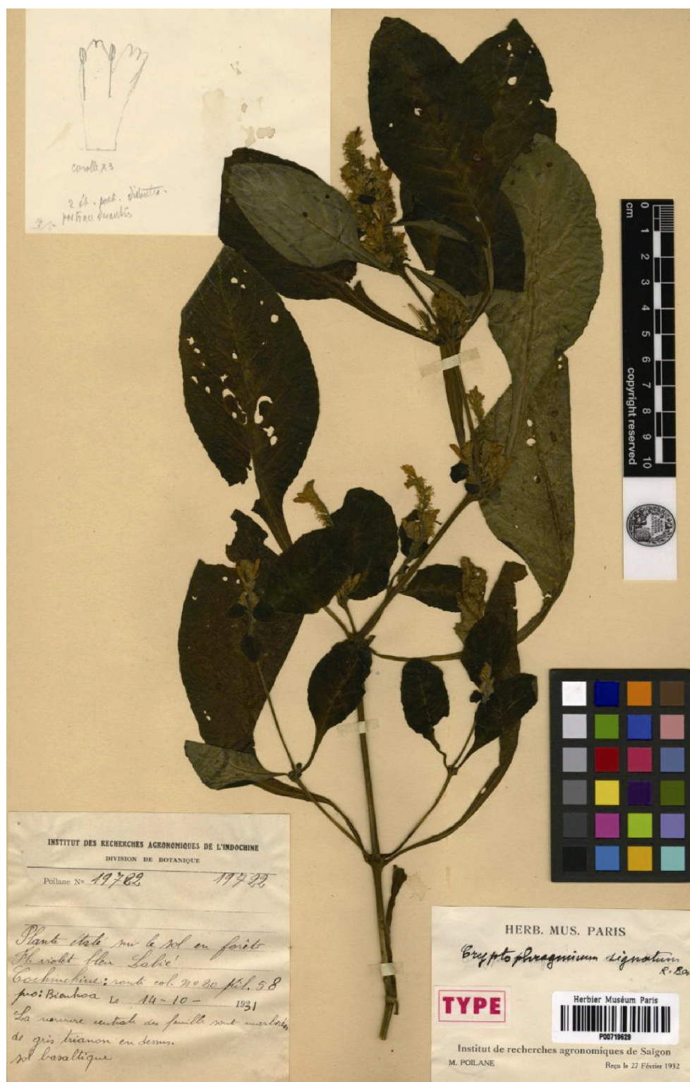
Fig. 1 Lectotype of Gymnostachyum signatum

(Fig. 1) with full field notes is here designated as the lectotype of the name Cryptophragmium signatum . Since this species has not yet been described in English, the emended full description is provided below.