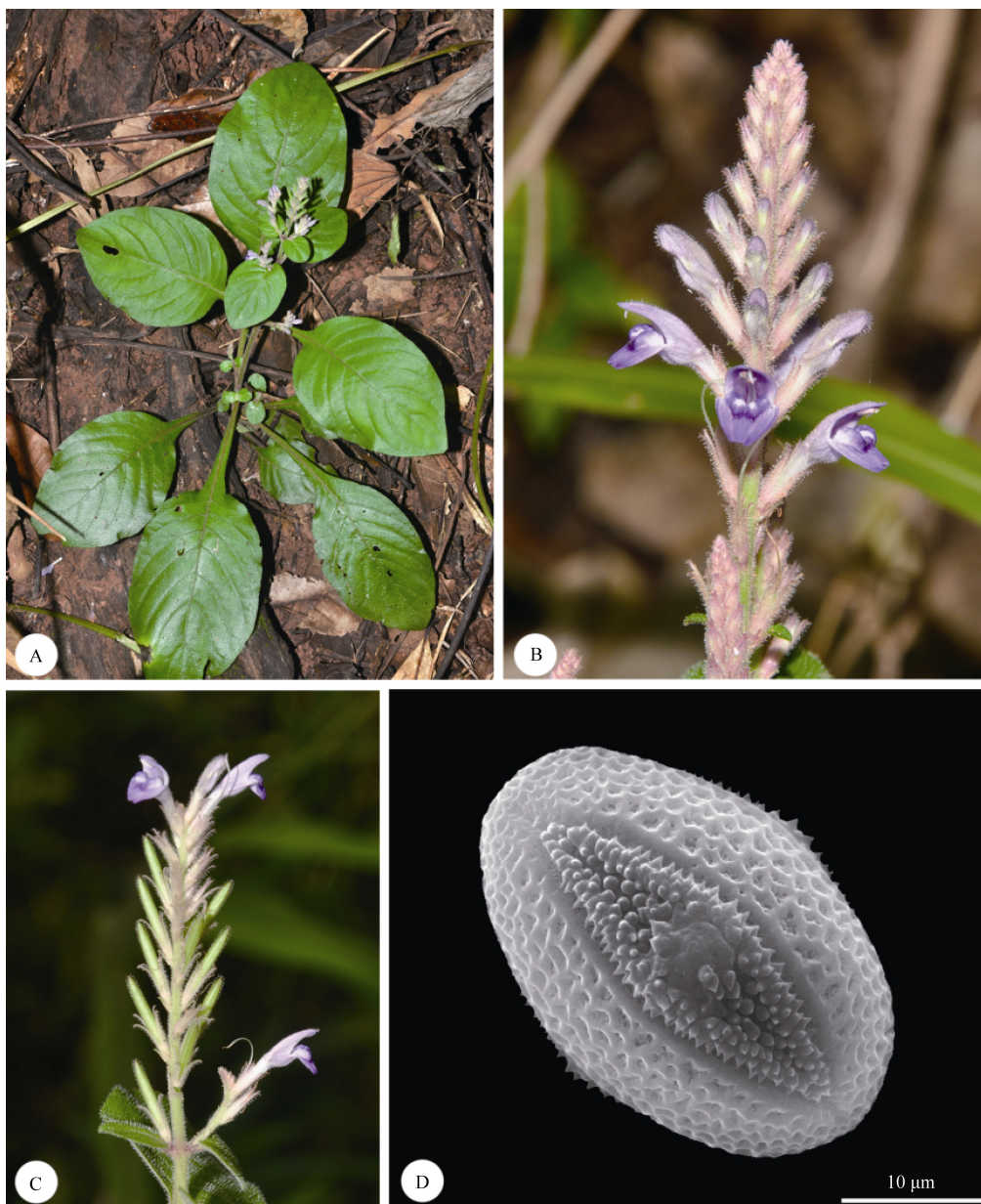
Fig. 2 Gymnostachyum signatum . A: Habit; B: Inflorescence; C: Inflorescence; D: Equatorial view of pollen grain

pubescent; leaf blades ovate, 7–10 cm × 5–6 cm, base cuneate, margin entire, apex obtuse, adaxially pubescent and densely covered with linear cystoliths, abaxially pubescent, secondary veins 7–8 on each side of midvein, camptodromous. Spikes terminal and axillary, 5–8 cm long, pubescent. Peduncle 1 cm long, pubescent. Bracts linear, 2 mm × 0.5 mm, pubescent; bracteoles 2, linear, 1.5 mm × 0.5 mm, pubescent. Calyx 5-lobed almost to the base, lobes linear-triangular, 5 mm × 1 mm, covered with long glandular hairs. Corolla 13 mm long, purple, outside pubescent, bilabiate, upper lip minutely 2-lobed, lower lip 3-lobed and inner side