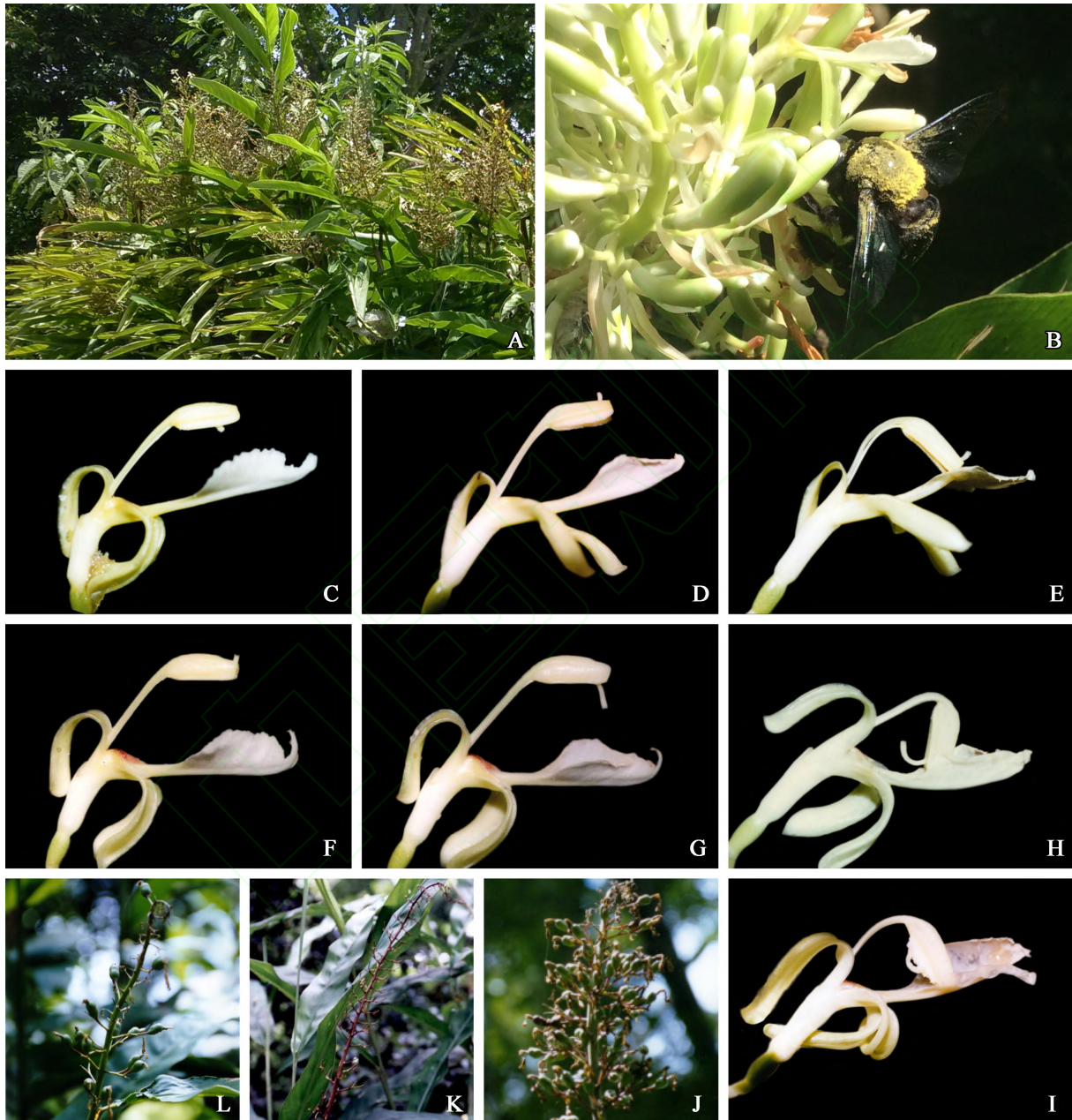
Fig. 1 A. Alpinia galanga (L.) Willd., showing the plant and habitat; B. Platynopoda magnifica pollinating Alpinia galanga , showing massive pollen grains on its back; C-E. Status of a single ANA flower in the morning, afternoon and night of the same day; F-H. Status of a single CATA flower in the morning, afternoon and night of the same day, showing the stamens of both morphs have bent towards the labelum at night, preventing pollinators from pollinating the flowers; I. If pollen remains on the anther of CATA flower after the style curves downwards, it is possible that stigma contacts the remaining pollen, completing autonomous self-pollination; J. The infructescence of Alpinia galanga in its natural state; K. Infructescence of bagged ANA morph, on which no flowers set fruit; L. Infructescence of bagged CATA morph, showing some fruit set but much less than the natural state, suggesting autonomous self-pollination occurred with inbreeding depression

anther, were recorded and photographed sidewise at one hour interval for 26 hours from 6:00 am in the first morning, with pollinator behavior as well as blooming pattern of flowers in the vicinity also observed and documented concurrently.