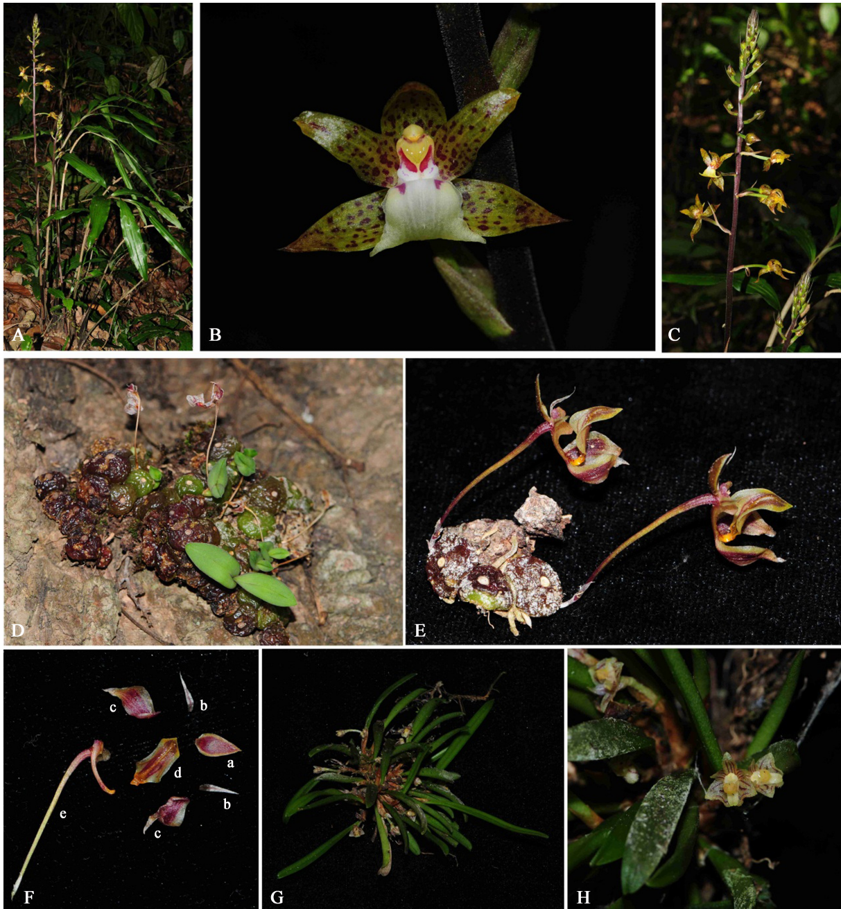
Fig. 1 A–C: Plocoglottis bokorensis . A. plant; B. flower face view; C. inflorescence; D–F: Drymoda siamensis . D. plant; E. flower side view; F. flower (a. dorsal sepal; b. petals; c. lateral sepals; d. lip; e. pedicel and ovary with column-foot.); G–H: Ceratostylis siamensis . G. plant; H. flower

olet, 5-veined, vein deep violet; petals slightly lanceolate, ca. 6–6.5 × 1–1.1 mm, fleshy, acuminate, 1-veined, vein violet; lip articulate, ca. 1.5 mm long, lip ovate-oblong, ca. 11–12 × 5.5–6 mm, fleshy, acute, 7-veined, vein deep violet, middle with a carinate; slightly 3-lobed, lateral lobes erect, semi-elliptic, mid-lobe ovate, acute, recurved; column