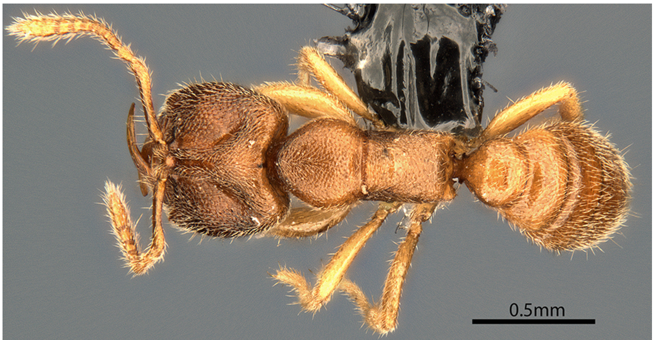
FIGURE 4. Bannapone scrobiceps sp. n., dorsum of holotype worker (Yunnan, CASENT0339957).

Mesosoma. In lateral view, dorsum of mesosoma convex and continuous with a distinctly impressed groove posterior to the promesonotal suture. In dorsal view, mesonotum constricted. Pronotum wider than propodeum. Metanotal groove weakly impressed on the dorsum of mesosoma. In lateral view, propodeal declivity separated in