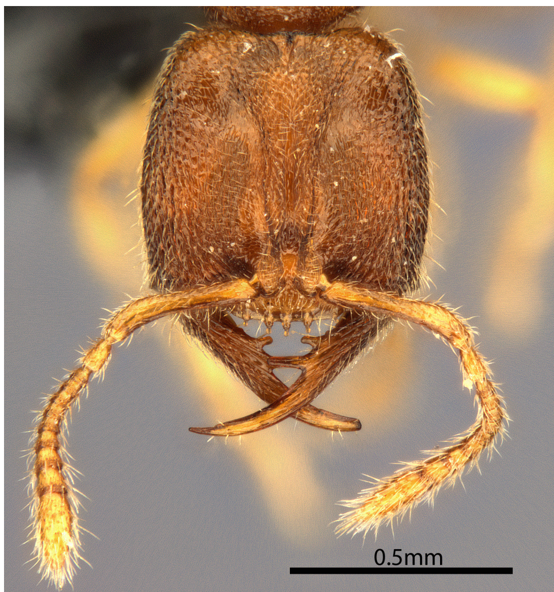
FIGURE 2. Bannapone scrobiceps sp. n., head of holotype worker (Yunnan, CASENT0339957).