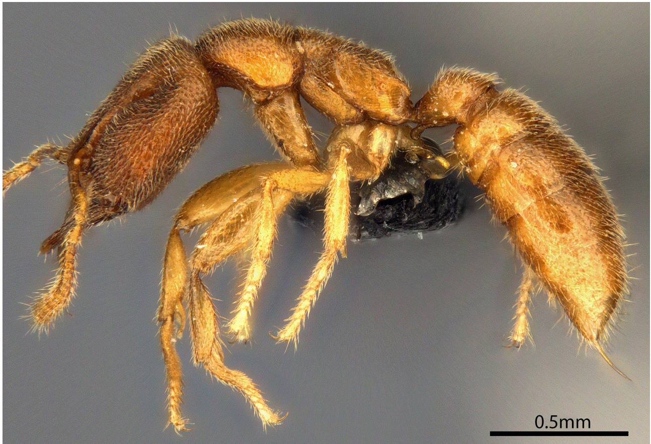
FIGURE 3. Bannapone scrobiceps sp. n., profile of holotype worker (Yunnan, CASENT0339957).