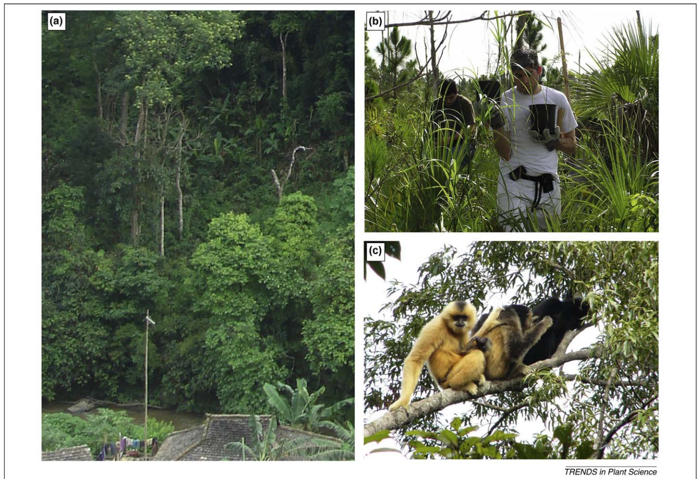
Figure 2. Examples of TBGs involving in in situ conservation programs. (a) A piece of unique tropical rainforest [43] has been proposed by XTBG scientists and accepted by local government to be preserved as a protected area, increasing the total protected area in Xishuangbanna from 14 to 16%. (b) Scientists and horticulturists from Fairchild Tropical Garden performing a successful reintroduction program. Within the past two decades, the garden has conducted 32 reintroductions of 11 species, in collaboration with land managers at its partner agencies. (c) With the help of technical and financial support from the Kadoorie Farm and Botanic Garden, the ecosystem and species status of the Hainan gibbon ( Nomascus hainanus ), the world's rarest ape, both significantly improved.

Dai Autonomous Prefecture approved, in principle, the boundaries of the proposed corridors. Forest restoration, awareness building and training, and a village-level revolving loan mechanism were performed within and outside the pilot corridor areas.