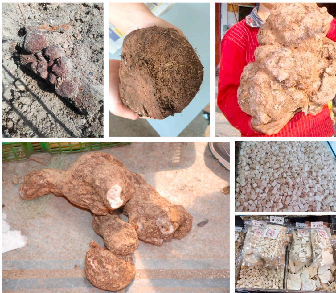
Fig. 1. Sclerotia of Wolfiporia cocos (colour figure available on-line). (For interpretation of the references to colour in this figure legend, the reader is referred to the Web version of this article.)

As in other locations in Asia, W. cocos that grows in the southern and south-western regions of China is found in pine forests. In Yunnan province this fungus is found on red and yellow earths, latosols and lateritic red earths (according to the Chinese soil classification system) that are polymetallic and humid. The conditions used by cultivars of W. cocos largely mimic that of wild growing individuals and the wood used for its cultivation are mostly pieces of pine ( Pinus yunnanensis ) trunks. Seasonally, in Yunnan, sclerotia are excavated in November,